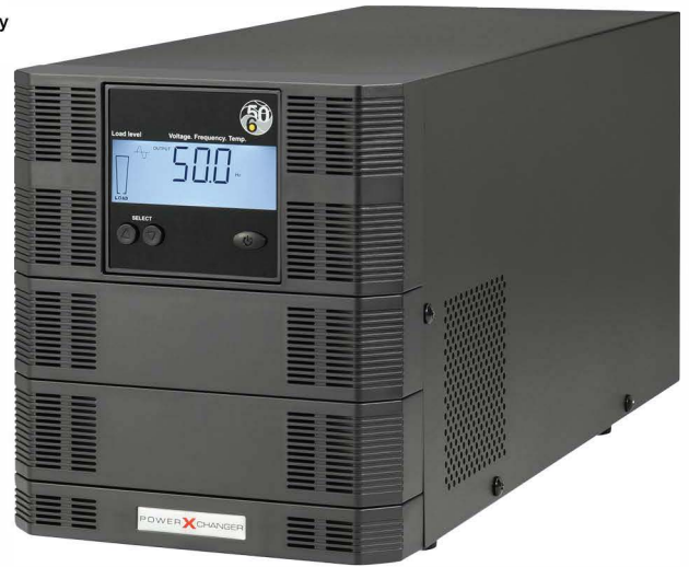
Model Numbers: UX-1K, UX-1.5K, UX-2K

Input Range: 100Vac- 285Vac Input Frequency: 50Hz/60Hz Automatic Output: 200V-220V-230V-240V (Selectable) Output Frequency: 50Hz/60Hz (Selectable)