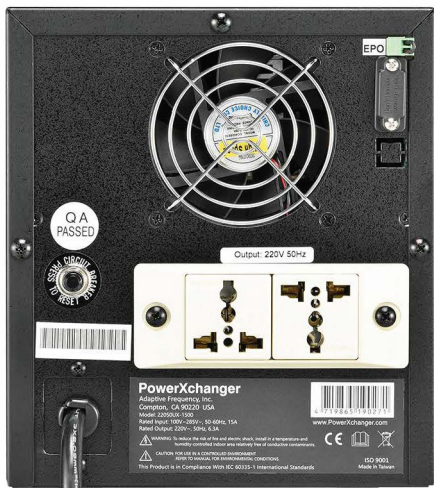
UX-1.5K & UX-2K

This series is a double conversion Power Converter which produces stable pure sine wave voltage and frequency output (O/P). With this Converter, you can protect your equipment from most power issues, including power sags, power surges, brownouts, and line noise. With the common neutral topology, the converter provides internal connection from AC I/P neutral to AC O/P neutral; thus, it does not need to use an isolation transformer to provide 0 volt from AC I/P neutral to O/P neutral. This feature will reduce the interference to loads of communication or video systems.